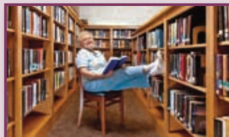
Enjoying the Library is Tudor Oaks resident XXXXXXXX

Fiction and Non-Fiction fill the shelves of the Wisdom Tree Library. From mystery buffs to history buffs and romance novel lovers the shelves provide hours of enjoyable reading material. An association with our local library also brings in new books each month, accommodating your favorite author and/or genre. Interesting thoughts are shared if you enjoy being part of a book discussion meeting. This Great Space also includes, movies and community computers.