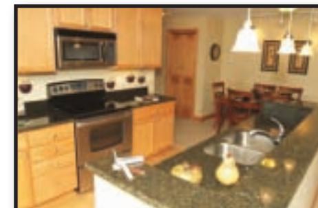
Tudor Oaks apartment home

We're looking for active seniors to come learn about what we have to offer on our newly redeveloped campus. Tudor Oaks is putting the finishing touches on a senior living community that is state-of-the-art. This is an excellent time to take a tour.