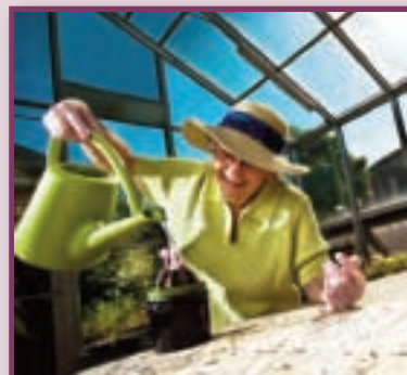
In the Green House is Tudor Oaks resident XXXXXXXX shapes and colors greet the senses with a regenerating freshness.

As you tour, you may notice residents with green thumbs. The Leaf & Petal Greenhouse Committee is always delighted to show off their lovely space. The greenhouse – attached to the Community Square – is an oasis. As you enter you immediately feel the refreshing touch of nature. Plants of all sizes,